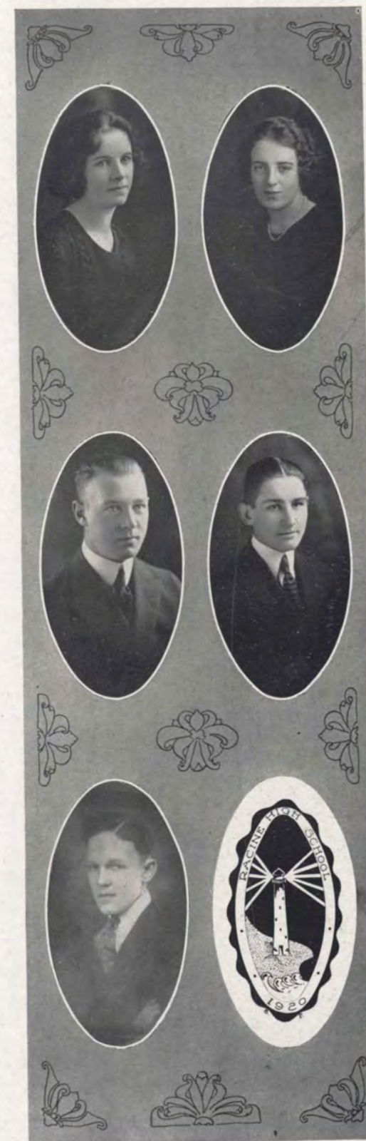
THE SCHOOL SEAL