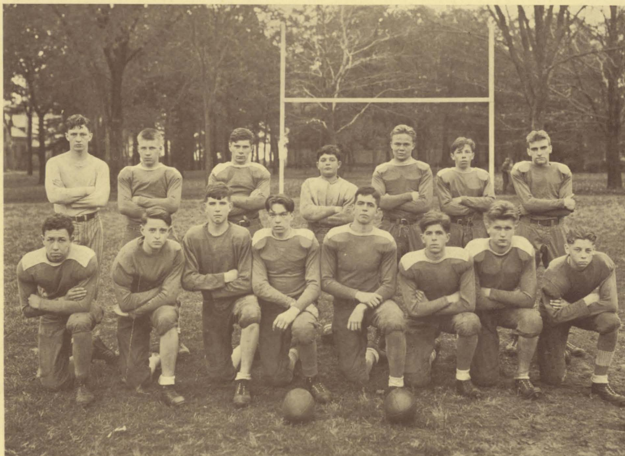
ATHLETICS —College athletics will be offered in the fall and winter of 1933. Football and basketball teams will be organized and they will compete with teams from other colleges in the middle west.

Tuition ..... $150.00 Laboratory fee ..... 5.00